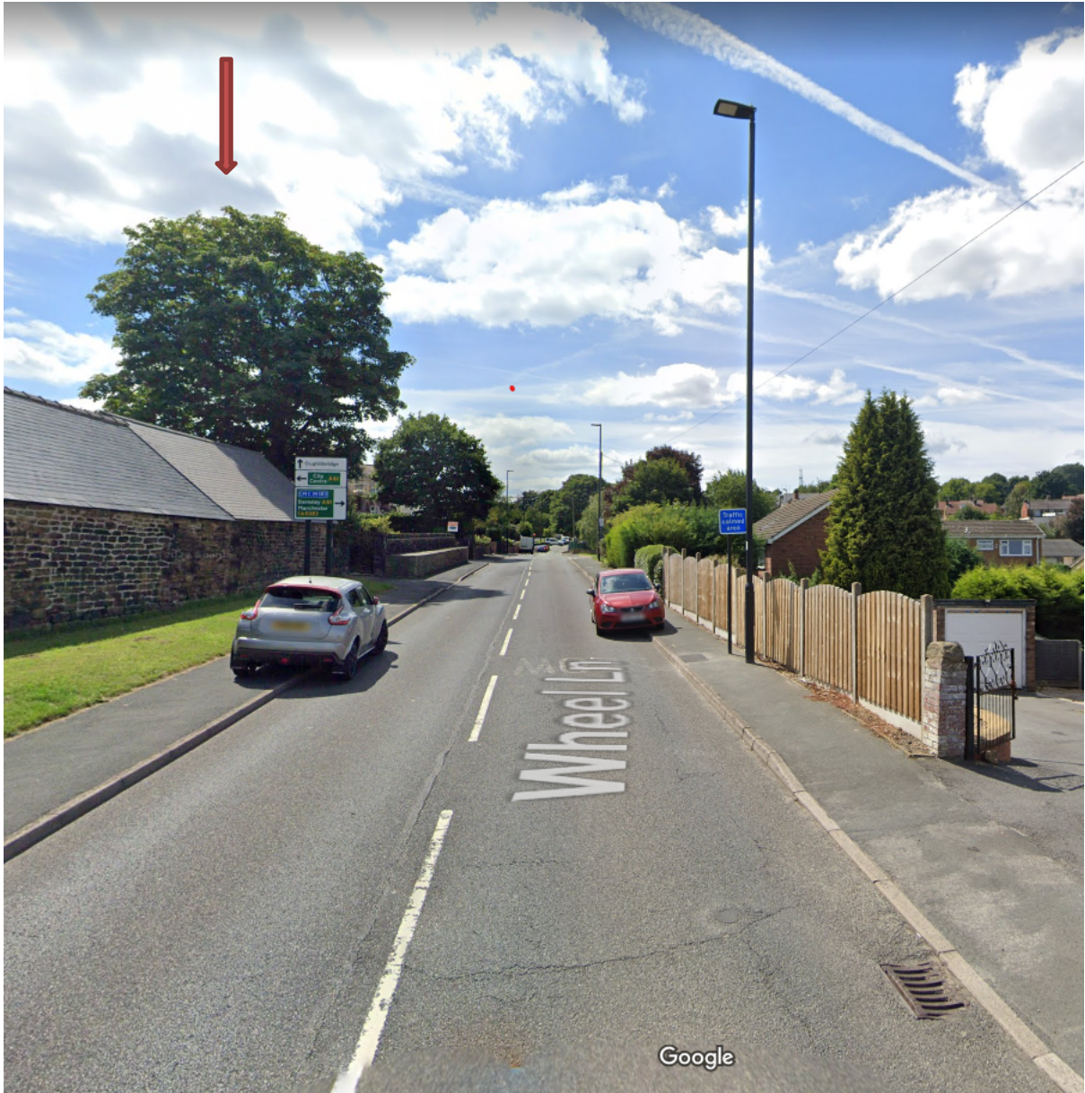
Image of the tree taken from Google Streetview, looking southwest along Wheel Lane, and showing the prominence of the tree in the streetscape.