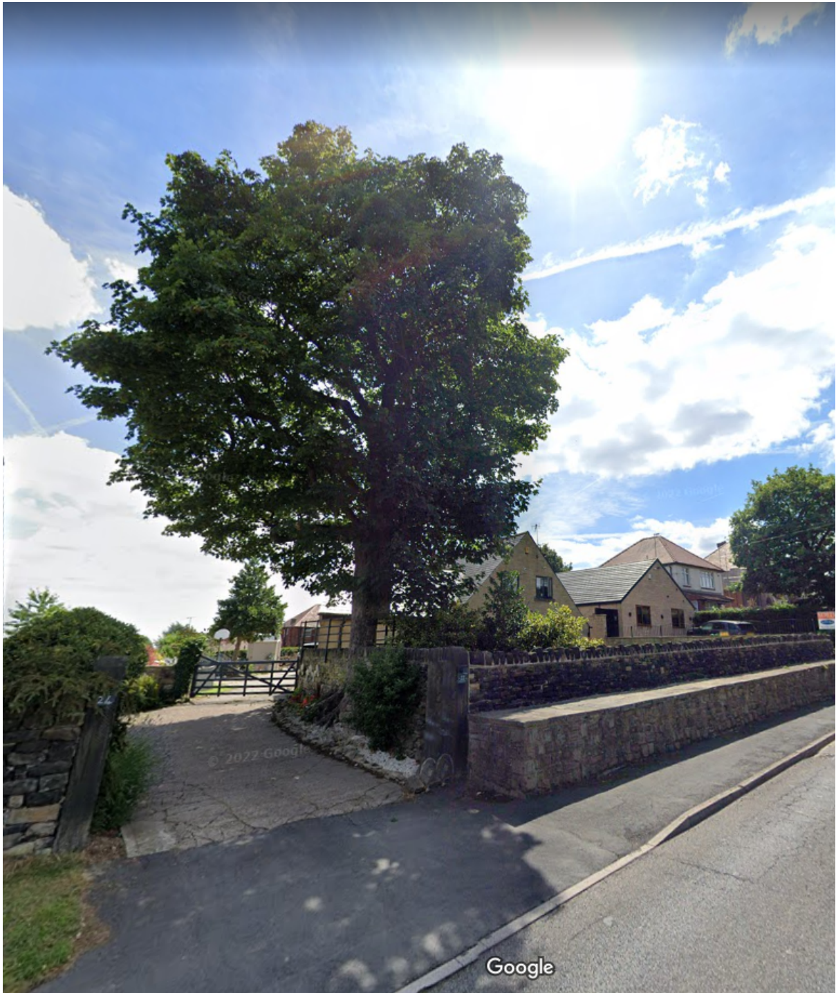
Image taken from Google Streetview showing the incorporation of the tree into the boundary wall.