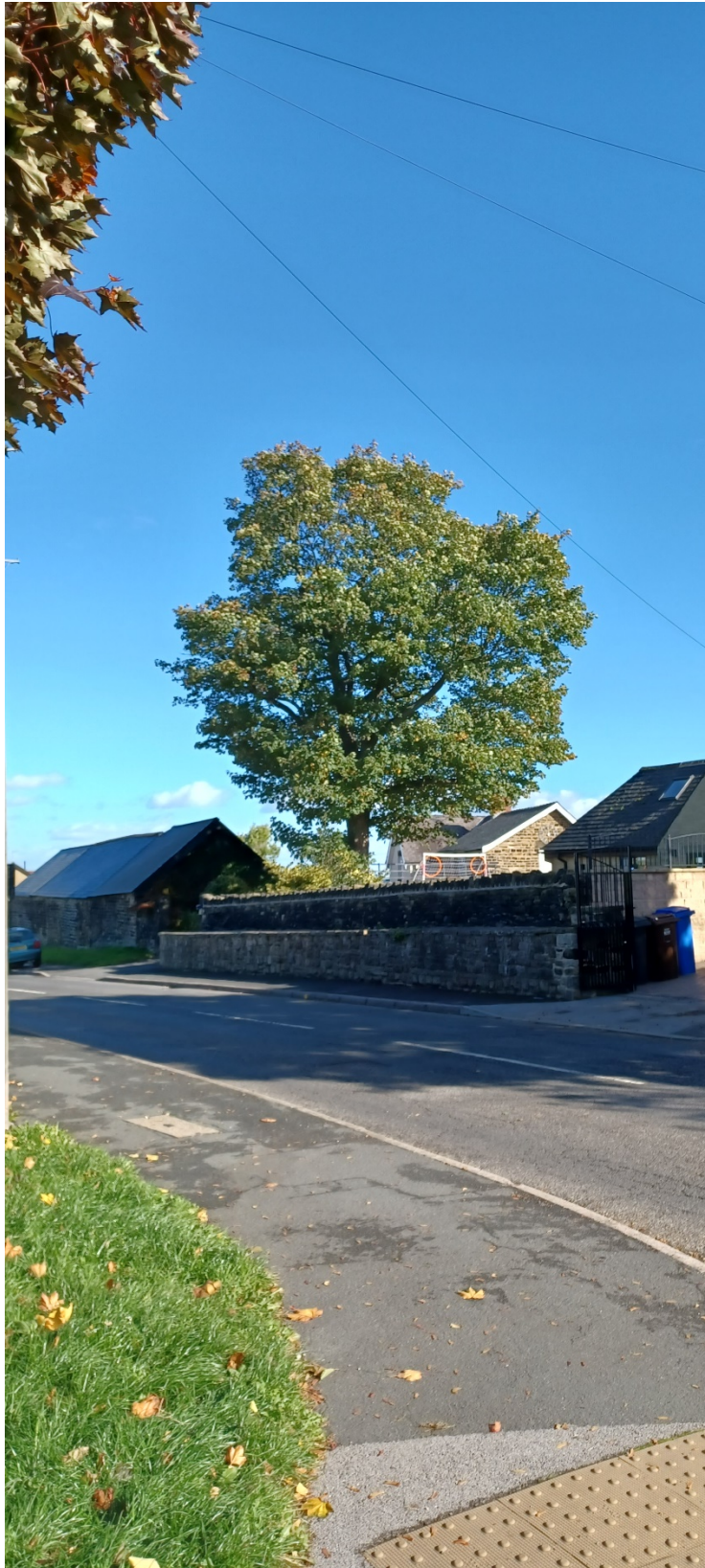
Image of the tree looking northeast along Wheel Lane, taken October 10 th , 2022.